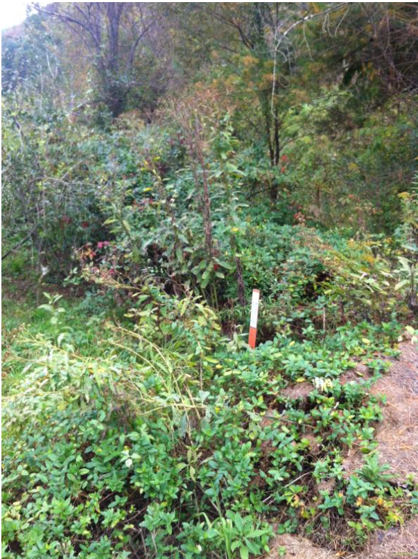
NCDOT conservation boundary markers