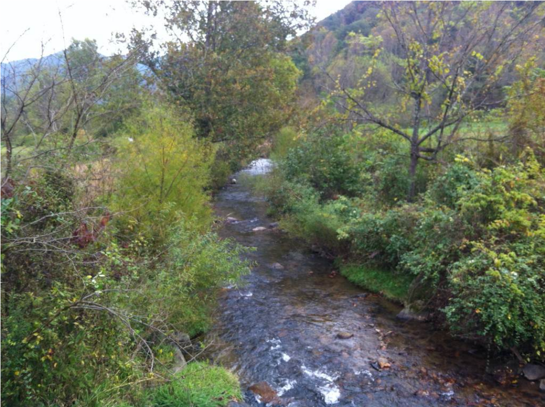
Facing downstream east