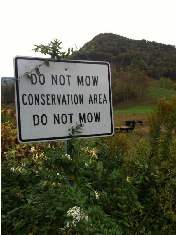
“Do not Mow” sign