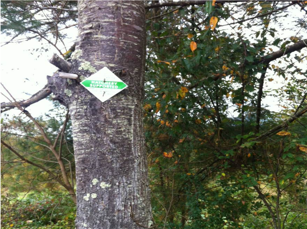
Hatchery supported water sign at the Baltimore Branch Road bridge